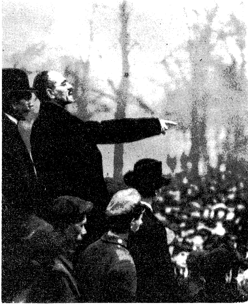
Karl Liebknecht speaks in Berlin

The coal and iron industry in Germany, Liebknecht continued, compared favorably with that in the United States. "Yet where will you find in Germany — monarchical, army-ridden Germany — a city that compares in its misery and hopelessness and stupidity with that plague spot of Pittsburgh? Why, Pittsburgh is simply hell with the lid off."